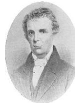
Barton W. Stone